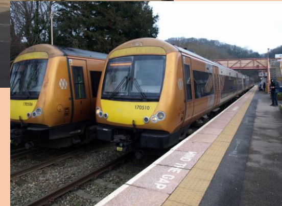
Ledbury Market House & Station