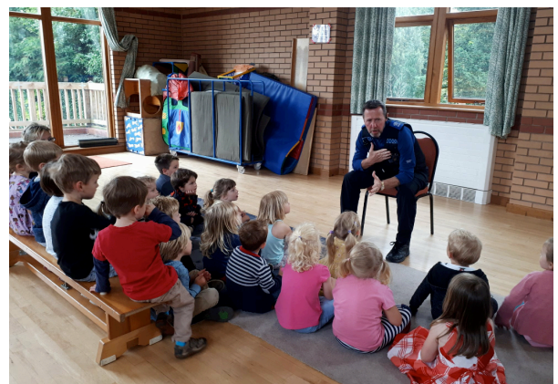
St Paul's Nursery: Talk about safety and the Police