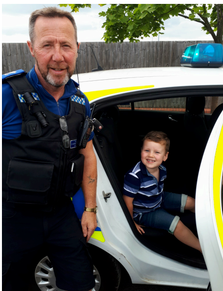
Holmer School: Summer Fete

If you have a group or event and you would like us to visit please get in touch and we will try our best to be there.