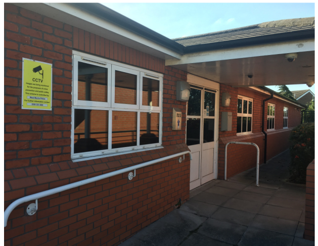
South Wye Station

Where we work: We cover St Martins, Hinton and Lower Bullingham area of Hereford.